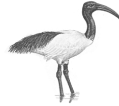
Sacred Ibis Threskiornis aethiopicus East Africa