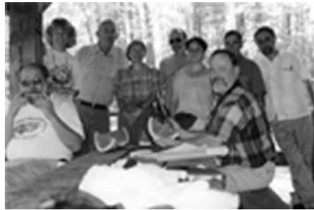
The Butterfly Counters