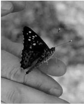
Hackberry Emperor