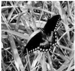
Spicebush Swallowtail