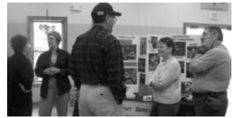
Our Booth at the New Garden Nursery Harvest Festival 10/22/05