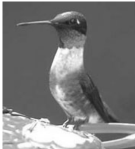
Ruby-throated Hummingbird

This was number twelve in our monthly walks at the park for 2004-05. Our new program year begins in September, during which we will be conducting bird walks at the park on a quarterly basis. The dates are Oct. 8, Feb. 25, Apr. 1, and June 24. Check our 2005-06 Yearbook for details on these and other field trips and bird walks.