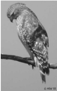
Red-shouldered Hawk