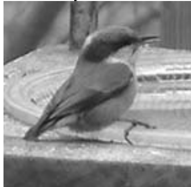
Brown-headed Nuthatch