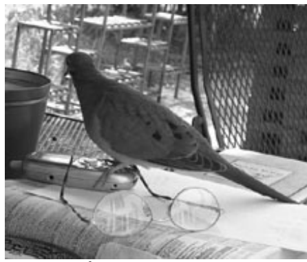
"These new-fangled phones - things were much easier when we just flew with the messages!"

-Lovey, the Rehab Dove