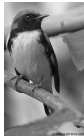
Black-throated Blue Warbler